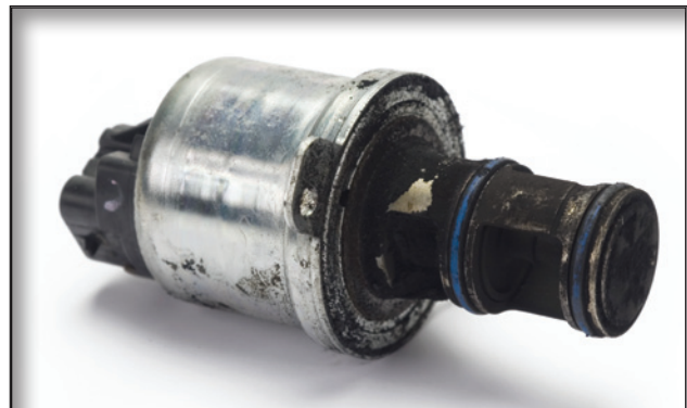
Soot-Contaminated EGR Valve